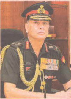
Chief of the Army Staff-designate Lieutenant General Dhiraj Seth will assume office in the afternoon of June 30, 2026

"As the Indian Army enters a decisive phase of its modernisation journey, Lieutenant General Seth takes over from General Dwivedi, who has set an impressive pace in driving far-reaching reforms. A key architect of this ongoing transformation, Lieutenant General Seth brings proven leadership to steer the army