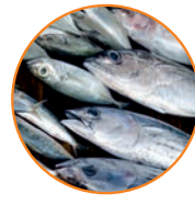
SALMON & MACKEREL