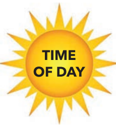
TIME OF DAY