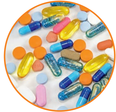
Dietary & Nutritional Supplements