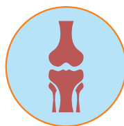
Bone & Joint Health